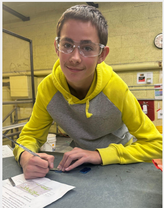
Students featured in this article are from Ecole Olds High School, Spruce View School and Bowden Grandview.

This year the opportunity is expanding to Grade 9. Students come to the campus for three days, separately throughout the fall, in rotations of 15 students at a time. New this year is having students coming to the opportunity with safety orientation completed online, so that more of the time is spent learning hands-on about welding, from expert journey person instructors.