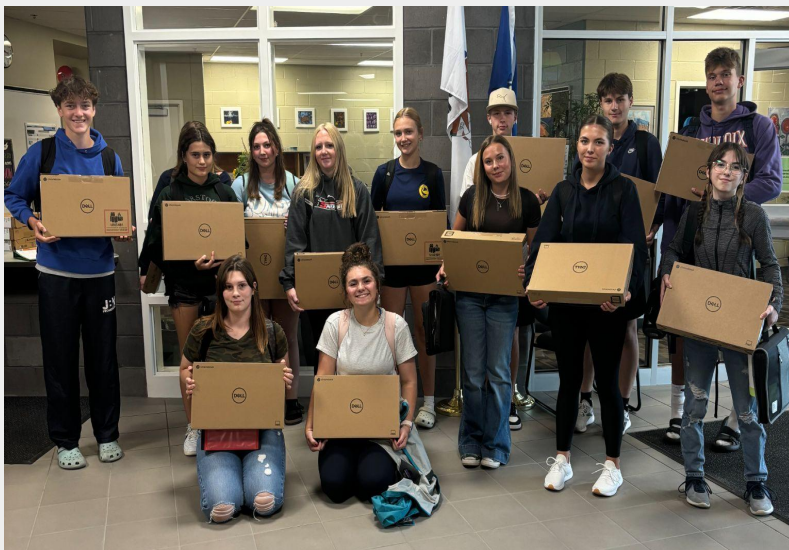
Ecole Olds School