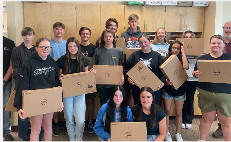
Didsbury High School