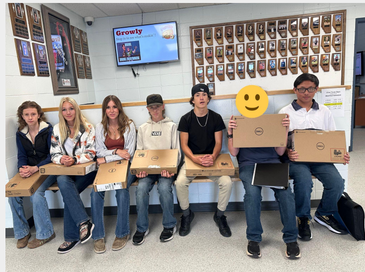
Sudre High School