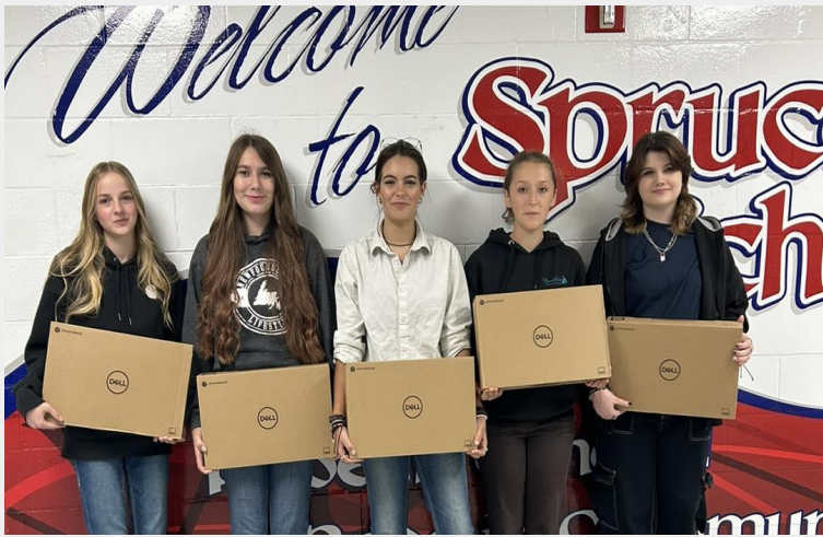
Spruce View School

In total, 186 students from all of the division's high schools participated in the Jumpstart program, with 142 students earning six credits. There was a 32 per cent increase in the number of credits earned in 2024, compared to 2023. Congratulations to the students who completed Jumpstart!