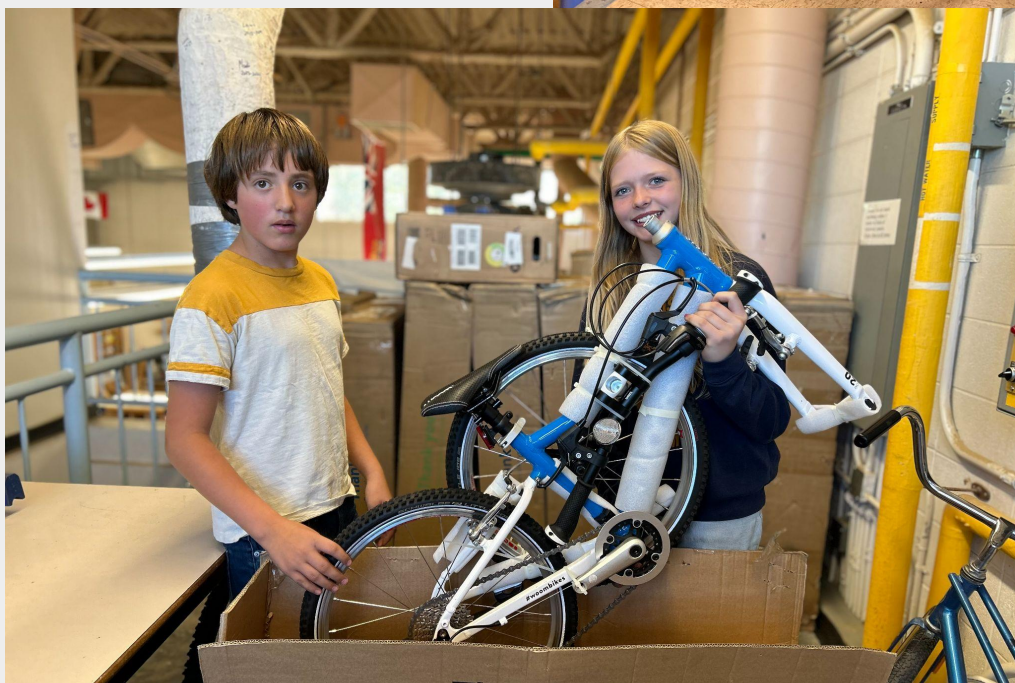
Photos this page: Westglen students working with the newly donated bikes.