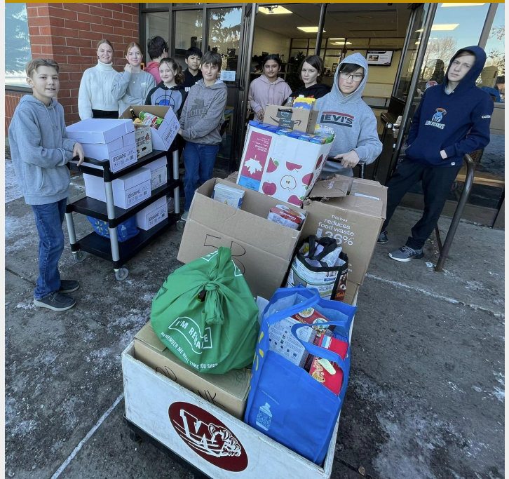
Top row: Food bank donations from Spruce View School (left) and Westglen School (in Didsbury).