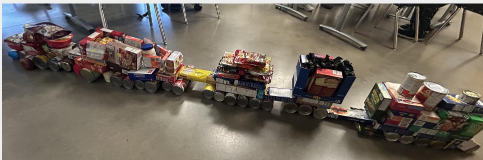
Bottom row: Students from one class at Didsbury High School were the fastest to collect some food bank donations early in the season (left). Students from Penhold Crossing School were 'on track' and 'on a roll' in shaping the direction of their foodbank donations (right).