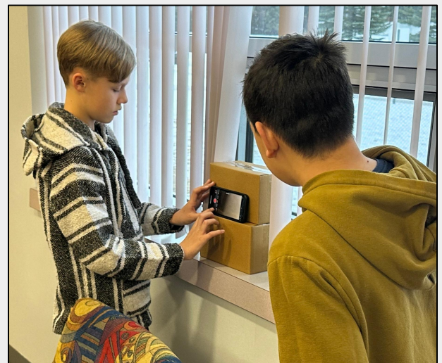
Photos on this page: Titan Talk producers record an interview with students from the school’s basketball team for an upcoming edition.