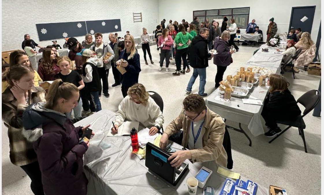
Right: a strong community turn out to the Bowden Grandview Christmas market was a key part of the event's success.