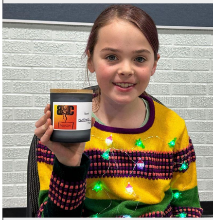
Above: A Grade 5 student sells a candle she created for the market.