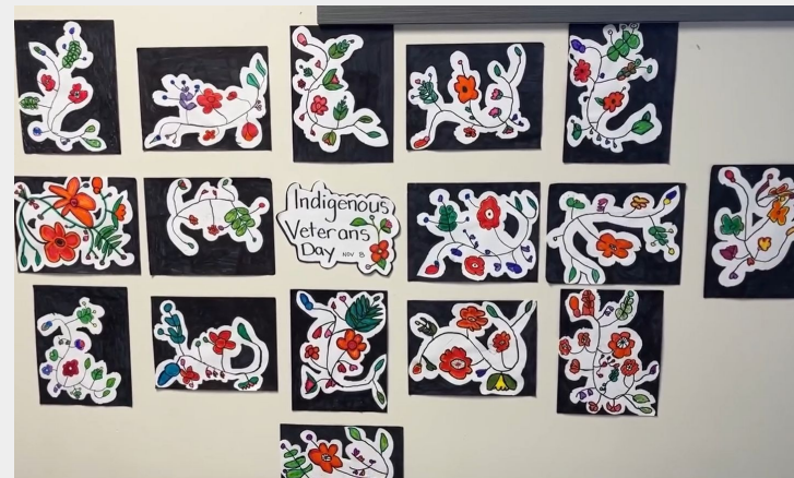
Above left: students from three Innisfail schools (Innisfail High, Innisfail Middle and John Wilson Elementary School) gather together to remember. Above right: Art to remember Indigenous Veterans, created by John Wilson Elementary students. Below: artwork created by Delburne students.