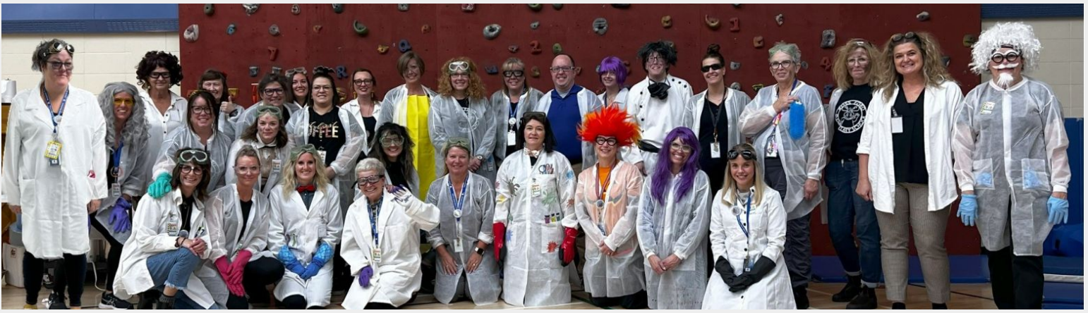
Ross Ford staff appreciate the 'mad scientist' persona... and had a little fun with it on Halloween. Below are different stages of two experiments done at school assemblies.