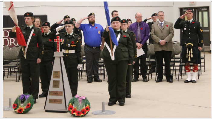
Above: Cremona School band playing at the school's Remembrance Day ceremony. Above right: a moment of remembering, from the Didsbury High School Remembrance Day ceremony.