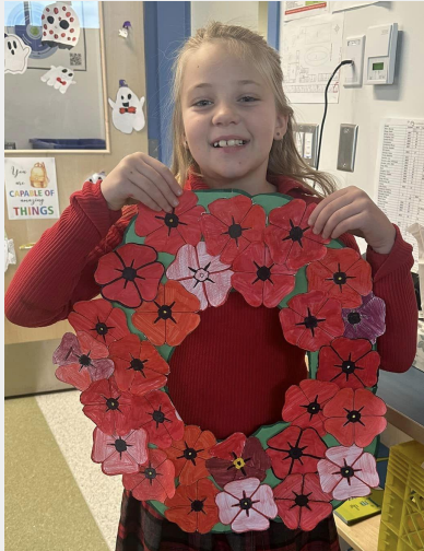
At Carstairs Elementary School

Chinook's Edge staff and students took time, last week, to remember the sacrifices of Canadian men and women, who fought for Canada in armed conflicts. Thank you to our staff for providing these valuable learning opportunities for students, and for helping us all remember. #RemembranceDay