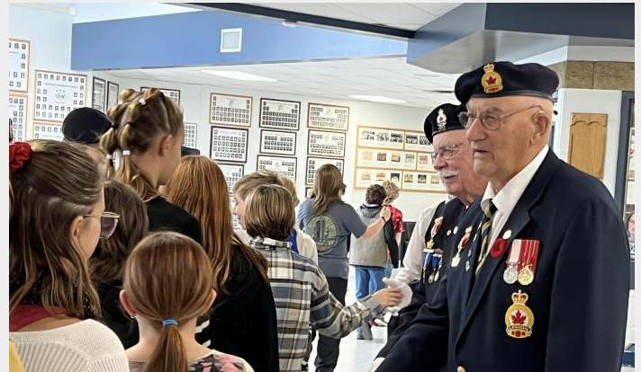
Below left: lighting a candle of remembrance at Poplar Ridge School. Below right: Meeting veterans at Ecole HJ Cody High.