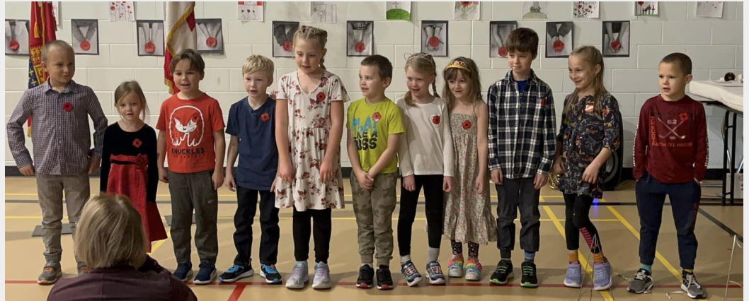
Above: Elnora School students. Below on the left: A procession at Penhold Crossing (and Penhold Elementary and Jessie Duncan School participated in this ceremony). Below right: meeting veterans at Delburne School.