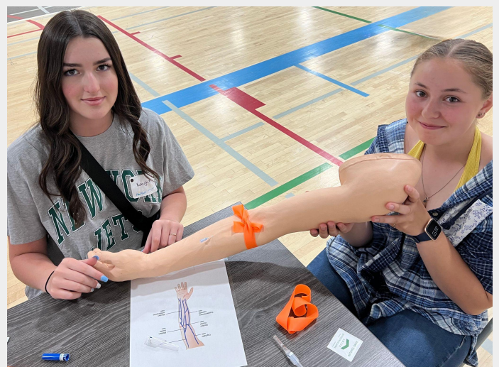
Top centre: Innisfail High School students attending healthcare day with community healthcare practitioners and leaders. Middle two photos from Sundre High School. Bottom photo from Innisfail High School.