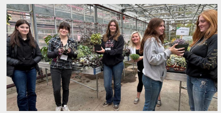
Young Women in Trades & Technology camp - May 11, 2023 at Olds College Campus