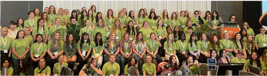
Young women from all over Alberta, including Chinook's Edge students, who attended Skills Canada

Also, CAREERS: the Next Generation, hosted a "Young Women in Trades & Technology" camp on May 10 at Olds College. Students from four CESD schools attended. Participants learned about landscape horticulture, welding, and agricultural & heavy equipment skilled trades, and experienced a "try-a-trade" activity.